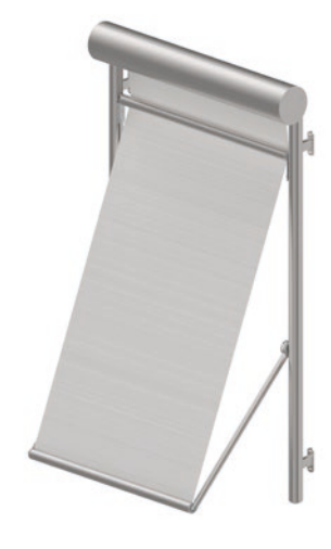
FM 202 Rail guiding with sloping projection unit