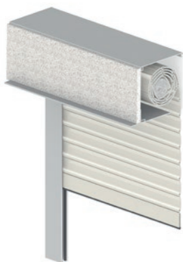
nova NQPA: Plaster base element square box