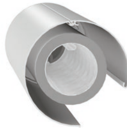
FM 200 round