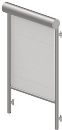
FM 201 Rail guiding