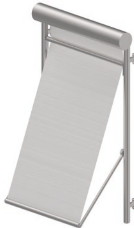
FM 202 Rail guiding with sloping projection unit