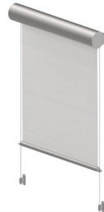
FM 203 Cable guiding